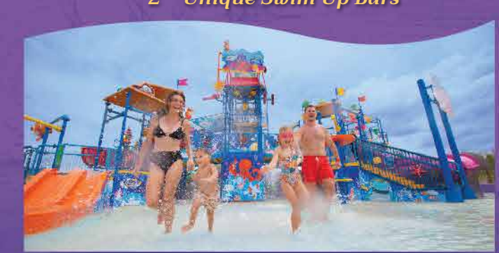
Facilities & Services